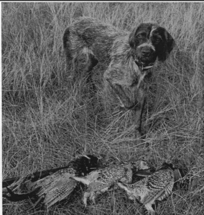
BOGIE OF AGASSIZ LOWLANDS ( Chyte Ze Zaplav x Berta of Show-Me-Borealis ) with a pheasant, sharptail and prairie chicken - (Photo by: Jack Freidel, October, 2001)