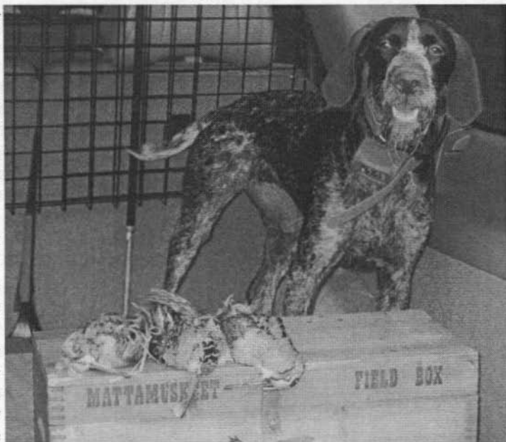
ABBA OF SHOW-ME-BOREALIS (Dan Cerniky x Brandy of Dutchman's Hollow) smiles proudly after a great day in the woods pursuing woodcock.

DOUBLE - ALMOST A TRIPLE!! Saturday Abba's Beeper Collar gave out that great sound of her being on point. The cover is still very thick here in Upstate NY and I could not see her. As I slowly made my way thru the alders and brush, I stopped momentarily to ponder what was the best way to approach the place where I thought she was. Just as I made my decision and took a step, I heard that great sound of a grouse taking flight. Much to my amazement it flew right across my right flank -- 1 shot from my O/U 28 gauge and down it came. Just as it hit the ground, another grouse took off from her point, flew the same route, and the second shot rang out and down came that one too. The beeper still indicated she was holding point and much to my surprise the 3rd bird went up and followed the same path, but - no live ammo left in the gun. That sure was a first for me, three grouse off from one point