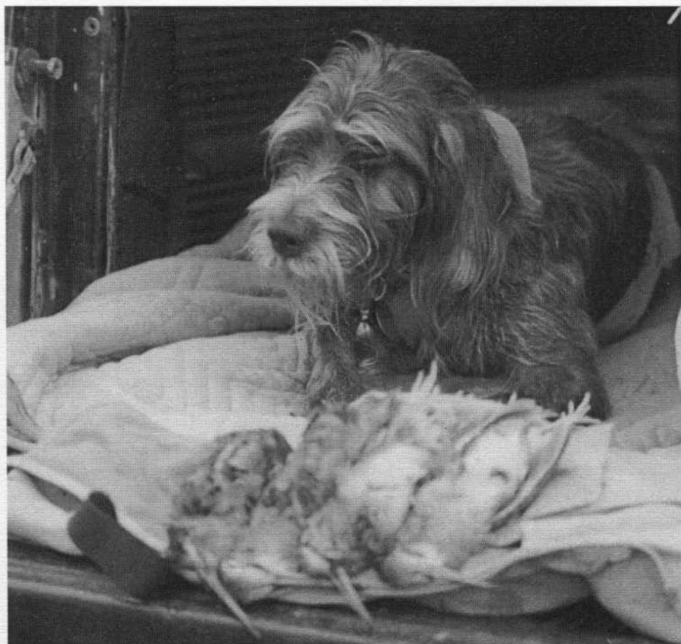
BRISBY OF ALDERBROOK ( Chyte ze Zaplav x Bailey of Ocean House) tries to stay awake for this photo after woodcock hunting along the Miramichi River - New Brunswick.