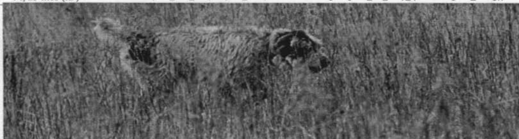
ALFFIE OF VALLEY HOUSE, NAT Prize I, Wisconsin

M, 23 mos (ID) 4 2 2 4 4 2 1 3 3 2 2 121 3 2 ok