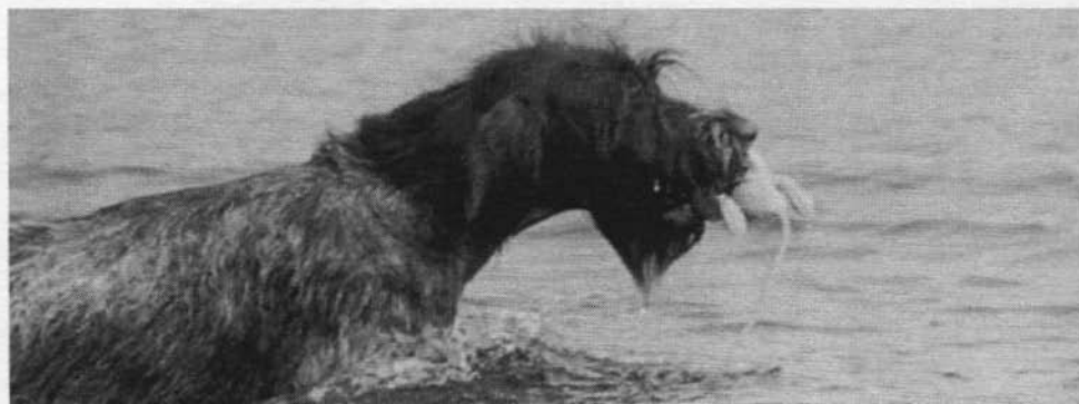
ABIGAL OF VALLEY HOUSE, NAT Prize I, Wisconsin