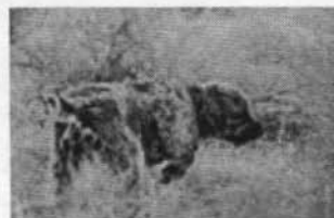
WAYFARER'S PRINCE TRUTZ, IHDT, Idaho