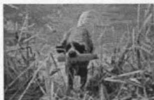
AUSTIN OF BANDED PEAK, NAT Prize I, Idaho