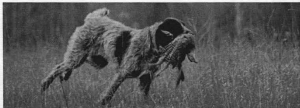
APRIL OF VALLEY HOUSE, NAT Prize I, Wisconsin

4 3 4 4 4 4 3 0 3 1 4 4 3 4 4 3 2 2 205 4 3 ok