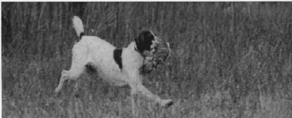
ACE OF VALLEY HOUSE, NAT Prize II, Wisconsin