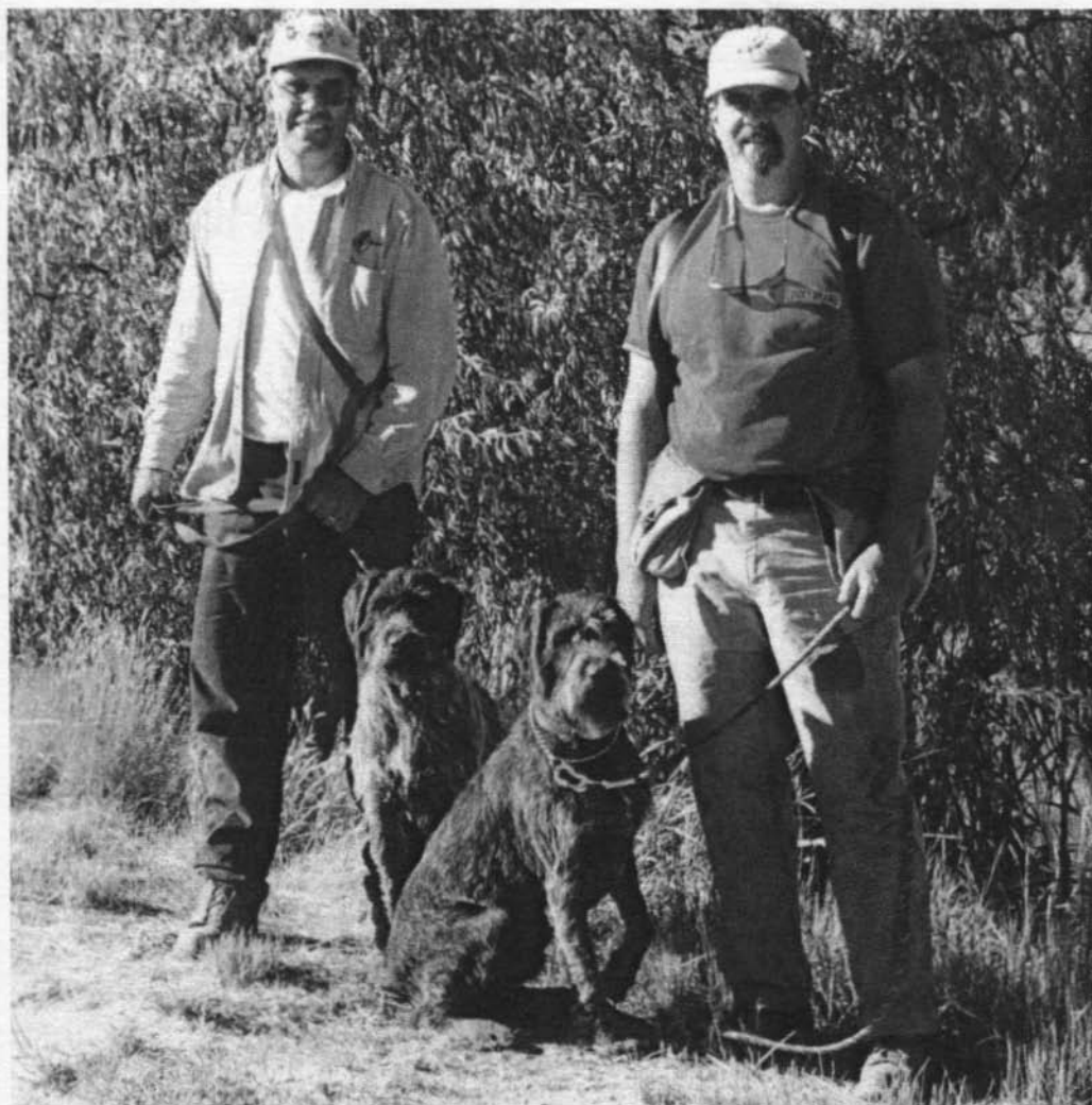
SPRING 2002 TESTS DATES