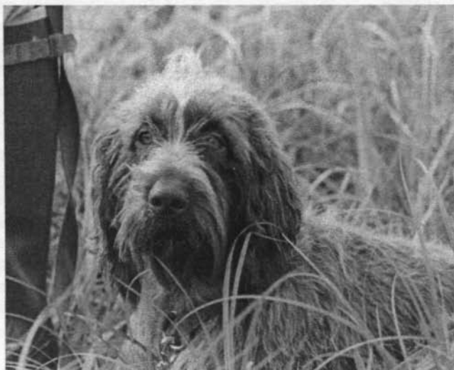
BUFF CHICO OF AGASSIZ LOWLANDS in Wisconsin