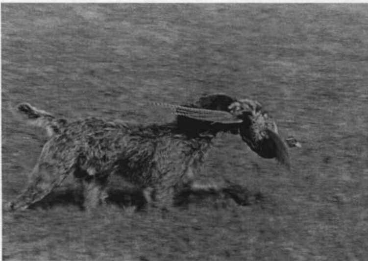
BECK OF AGASSIZ LOWLANDS in his IHDT

-And finally, we had further proof that even reasonable individuals, once they become part of a judging group will find a way to use up the whole day and almost delay dinner - even if there are only two dogs being tested. But perhaps I am being too harsh....I am sure that if none of the dogs showed up for the test our judges would be able to finish up their discussions by mid afternoon.