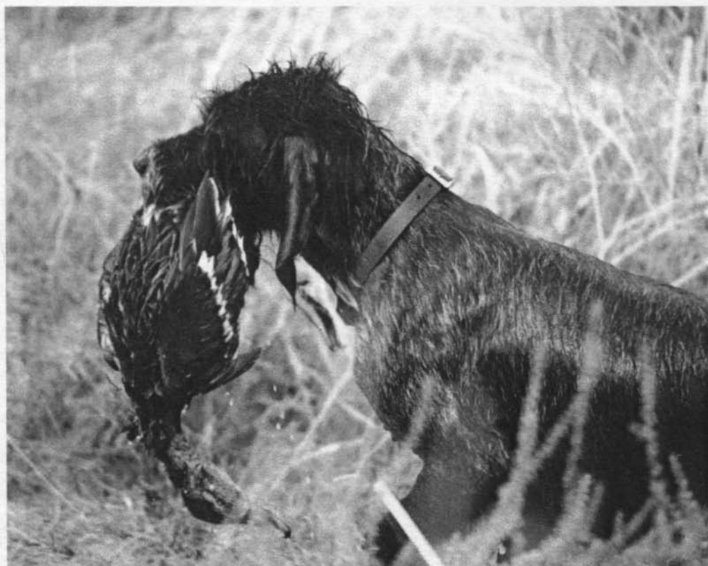
BELA OF HIGH DESERT on her way to a Prize II in her IHDT in Idaho