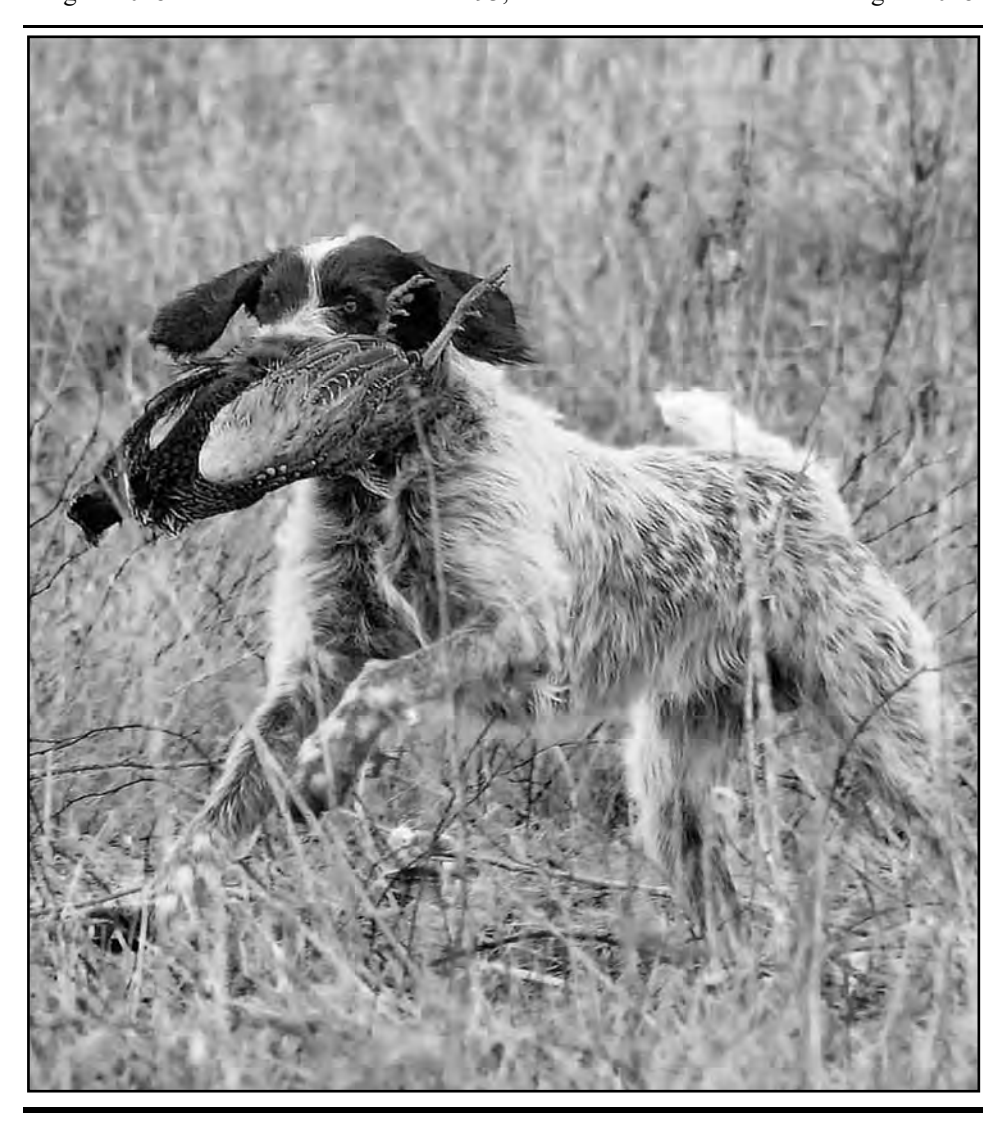
Copyright © 2018 Bohemian Wirehaired Pointing Griffon Club of America Education and Research Foundation. No part may be reproduced in any form without written permission from the Bohemian Wirehaired Pointing Griffon Club of America Education and Research Foundation.

August 2018 Volume 93, Number 4 August 2018