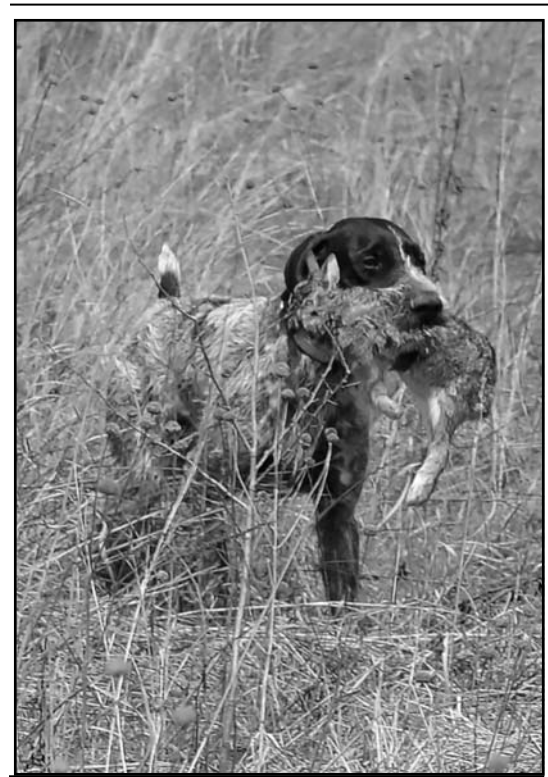
Drag of Furred Game is optional in IHDT Monica Redmond elected to give it a try with Fousek Z Sakered Bohdan.