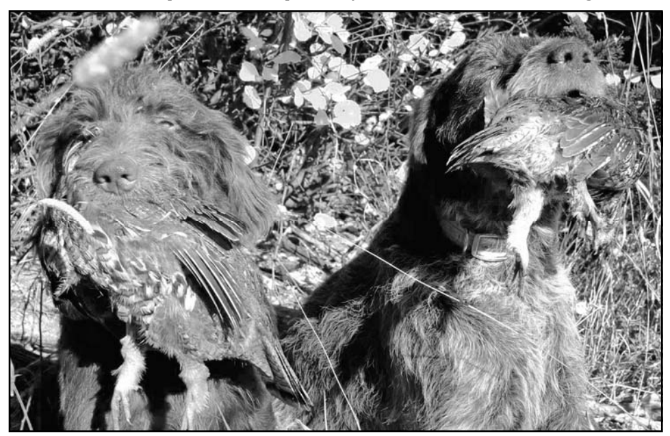
Hey Boss! Get the skillet ready!

NOTE: Remember pistachios are quite salty, so do NOT salt when cooking.