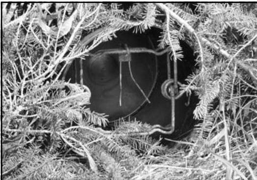
Close up view of a cubby set trap

The 7" X 7" size is often used in a cubby set with a bait of meat or fish in the back of the cubby. The cubby can be a hut of branches, a box of wood or, as often the case here in Minnesota, a large plastic pail modified to hold the trap. The cubby is concealed in grass and brush, often along a trail.