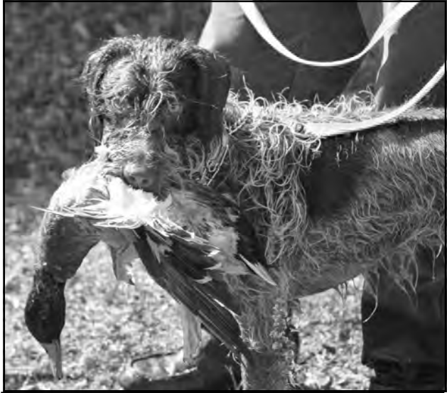
Clyde of Sandhill shows off his duck