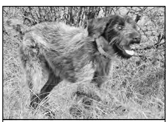
Boone of Salmon River completes NAT search.

On one live track for a NAT dog, senior judge John Pitlo had to restart one "chicken" four times. The last