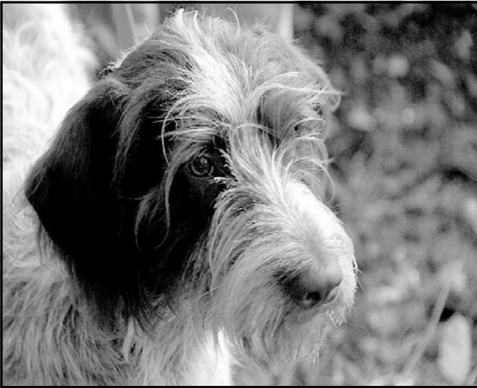
Archibald of Cattail Storm Owner-Steve Meuter